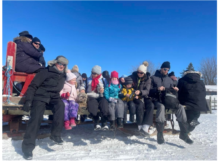
Polonia cherishes Polish traditions. The sleigh ride of the Sokół Saint Boniface at Birds Hill Park