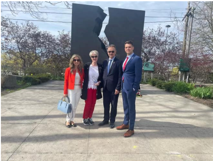
The President of the KPK MB participated in the ceremonial laying of wreaths by representatives of the government and the Sejm at the Katyn Monument in Toronto.