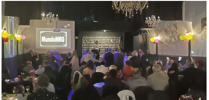
Back to the 80s in Sokół St Boniface! Dancing in the rhythm of songs from those years :)