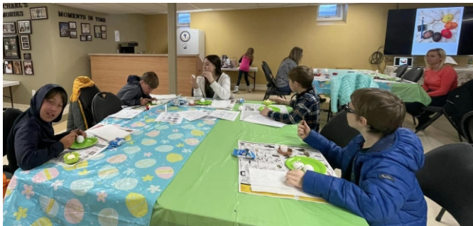
Egg painting at Cooks Creek. The children had the opportunity to cultivate the Polish tradition of Easter eggs.