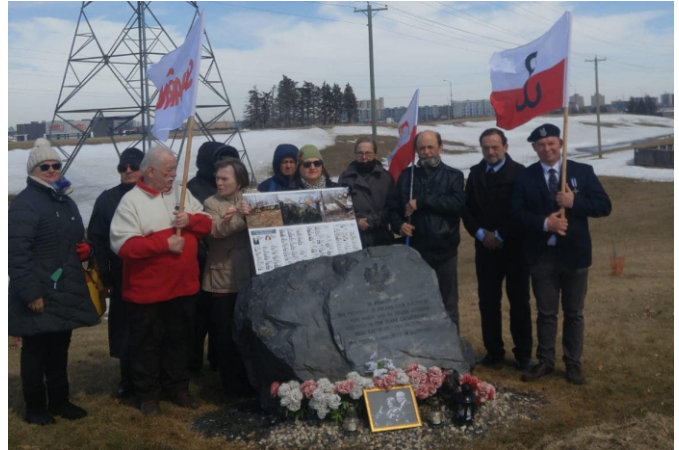
The Polish community in Manitoba remembered. Representatives of our community paid tribute to those who died 13 years ago near Smolensk.