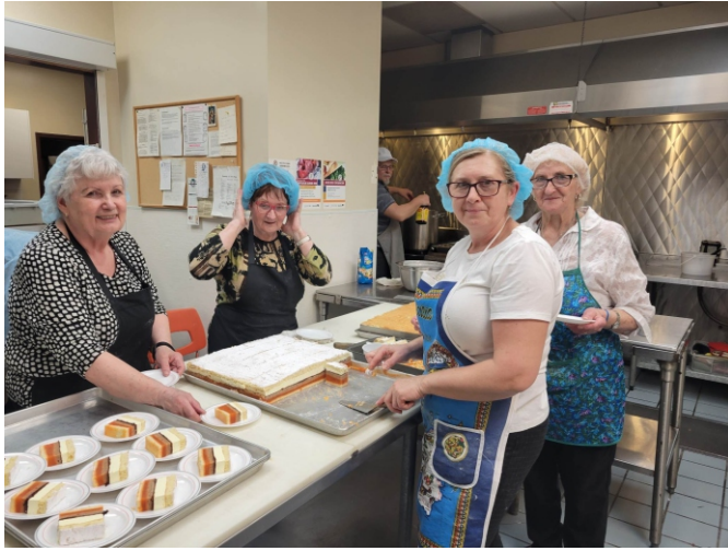
Preparations for Easter Breakfast at Holy Ghost Parish in Winnipeg.